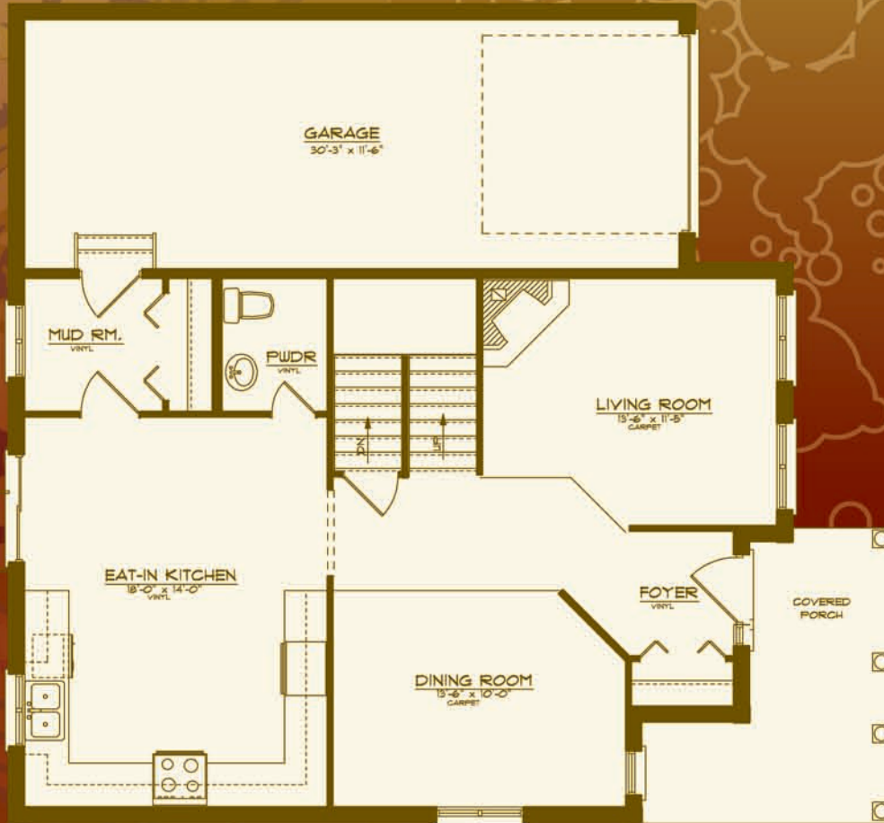
Main Floor 889 Sq. Ft.